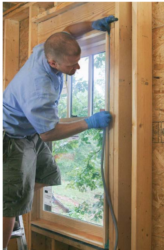
A caulk joint that will last. Foam backer rod cut and pressed in around the window jamb creates a flexible base for the bead of caulk that follows it. Use a wet finger to smooth the bead against the backer rod, creating the ideal hour-glass shape that allows the sealant to expand and contract without cracking or debonding.