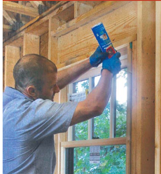
A conservative bead of foam. A thin bead of low-expansion spray foam offers limited air-sealing and insulation, but avoid filling the entire cavity, especially toward the bottom, to allow for drainage in the case of water entry.